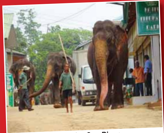
The Maha Oya River.

On this tour you will visit the Pinnawala Elephant Orphanage, Dambulla Temple Caves, Minneriya National Park, Polnnaruwa the Medieval Capital of Ceylon, climb the Rock Fortress, wander through the vast Tea Plantations at Labookellie Estate, experience tea tasting and tour the Tea factory. Plus much more.