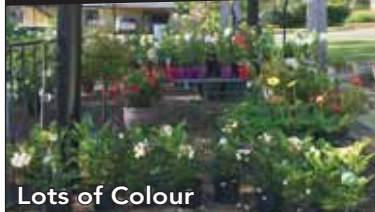
Lots of Colour